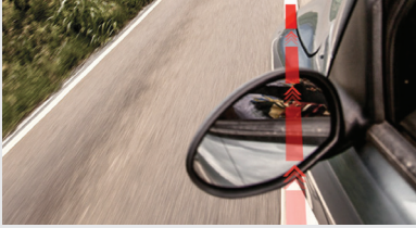
LDWS Lane Departure Warning System

The IROAD FX series is equipped with the Road Safety Warning System that provides audio and visual alerts for Lane Departure (LDWS), Front Collision (FCWS) and Front Vehicle Departure (FVDW). It detects road markings and gives voice warnings to the drivers if the vehicle begins to stray from its lane or when it is at risk of an imminent crash.