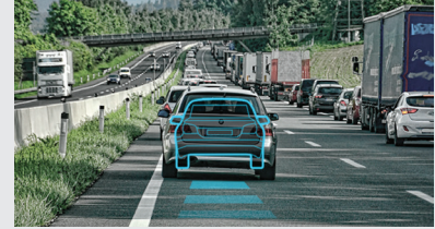
FVDW Front Vehicle Departure Warning