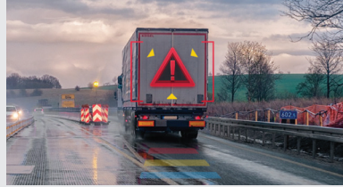
FCWS Forward Collision Warning System